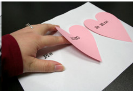
Step 5. Gently peel off hearts.