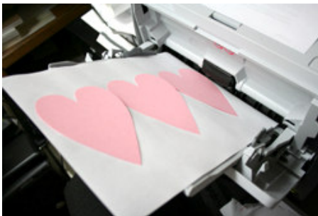
Step 4. Load onto manual feed of printer. Print template page again.