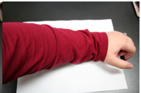
Step 3. Put a small amount of tape onto words. Low tack your tape by letting it pick up some lint (We used a shirt sleeve here.)